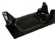
TRCO2/ 工具擱置塊 Handpiece Cradle