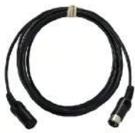
KE50-155/ 延伸線 Handpiece extension cord Length : 3.0 meters